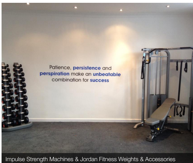
Impulse Strength Machines & Jordan Fitness Weights & Accessories