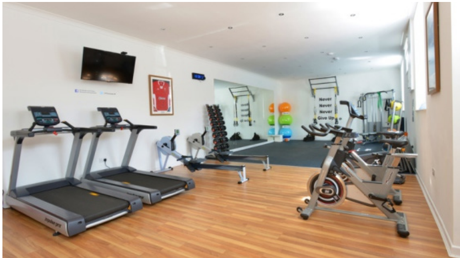
State of the Art PT Studio

Obviously there are requirements for a space like this to have key pieces of gym equipment like a treadmill, cross trainer and bike, however Mike expressed a strong interest in creating a modern environment that supported functional activities like suspension training, kettlebells and ViPR. The large space at the far end of the studio was fitted with a Beaver Fit Functional Training Rig wing attachment to facilitate the TRX training area Mike wanted to incorporate. Also in this functional section of the studio we installed an Impulse IFFT Dual Adjustable Pulley, which is one of the most versatile pieces of functional cable equipment available. The studio's cardio equipment offering also features Impulse equipment in the form of two PS300 Indoor Cycles alongside R700 series Treadmills and Upright Bikes.